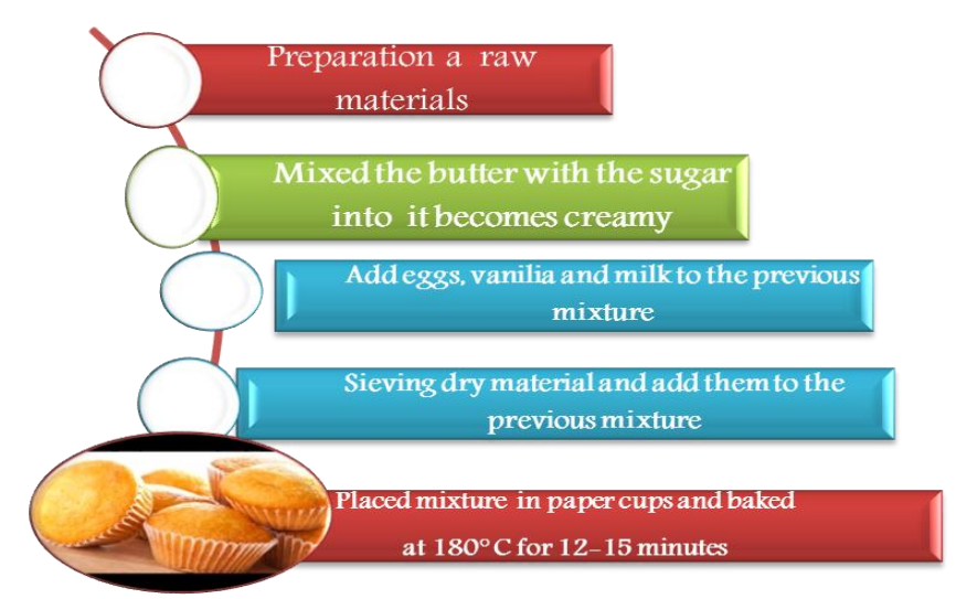
Table (2): Formulation of Cupcake